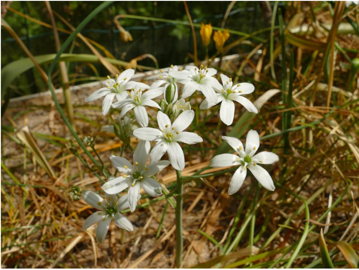
Ornithogalum sp from Turkey