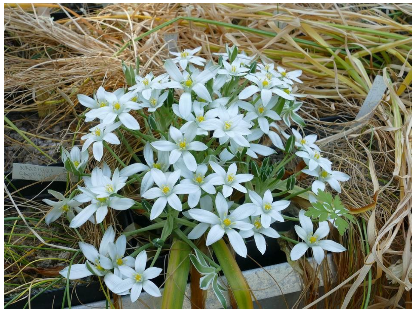
Ornithogalum sp ex Greece

follow the same pattern or because the leaves form long before the flowers emerge, do their flower buds wait all that time to appear or might they form earlier in the same season? If the bulbs behave the same way in nature then it cannot be efficient to be trying to make next year's flower buds at the same time as the current ones are in flower and when the yellowing leaves cannot be gathering maximum energy – I see more bulbs will have to be sectioned as I try and answer my question.