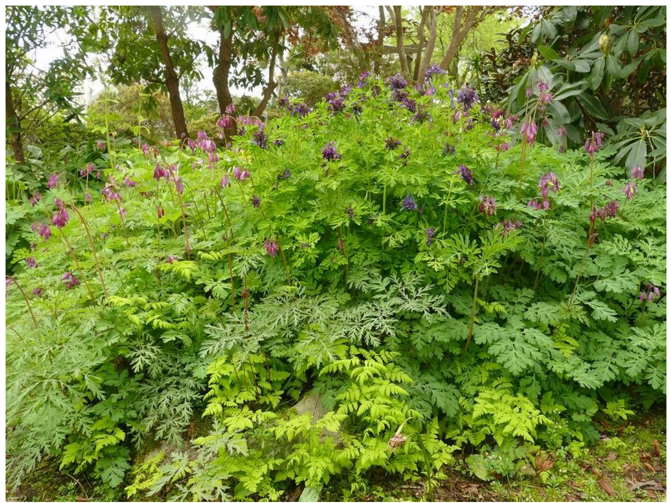
One of my favourite planting combinations with Corydalis 'Craigton Purple' is this one where the various Dicentra hybrids and ferns all share a variation on the theme of leaf form and colour.

On decorative values this sister Corydalis capitata hybrid seedling came close to being chosen but the seedling I eventually selected stood out on adaptability, vigour, ease of increase as well as decoration.