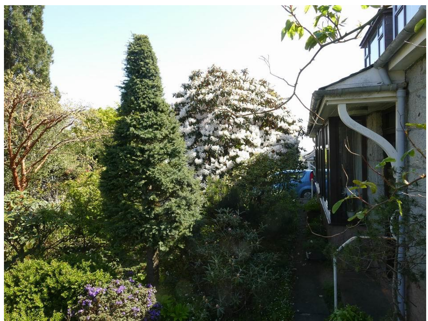
To give an impression of the size of this Rhododendron bureavii here it is growing in the front garden where it towers above the gutters on the roof.