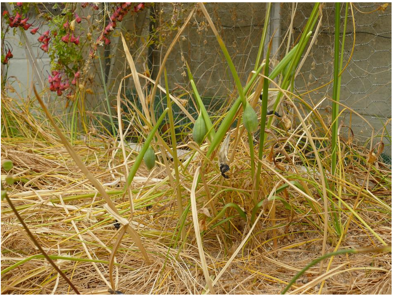
Still green Hermodactylus tuberosus with seed pods.

The bulbs in the 'U'shaped sand bed are also retreating back underground for the summer with the only seeds being on some Hermodactylus tuberosus, which are still green, while all the others around them have died back.