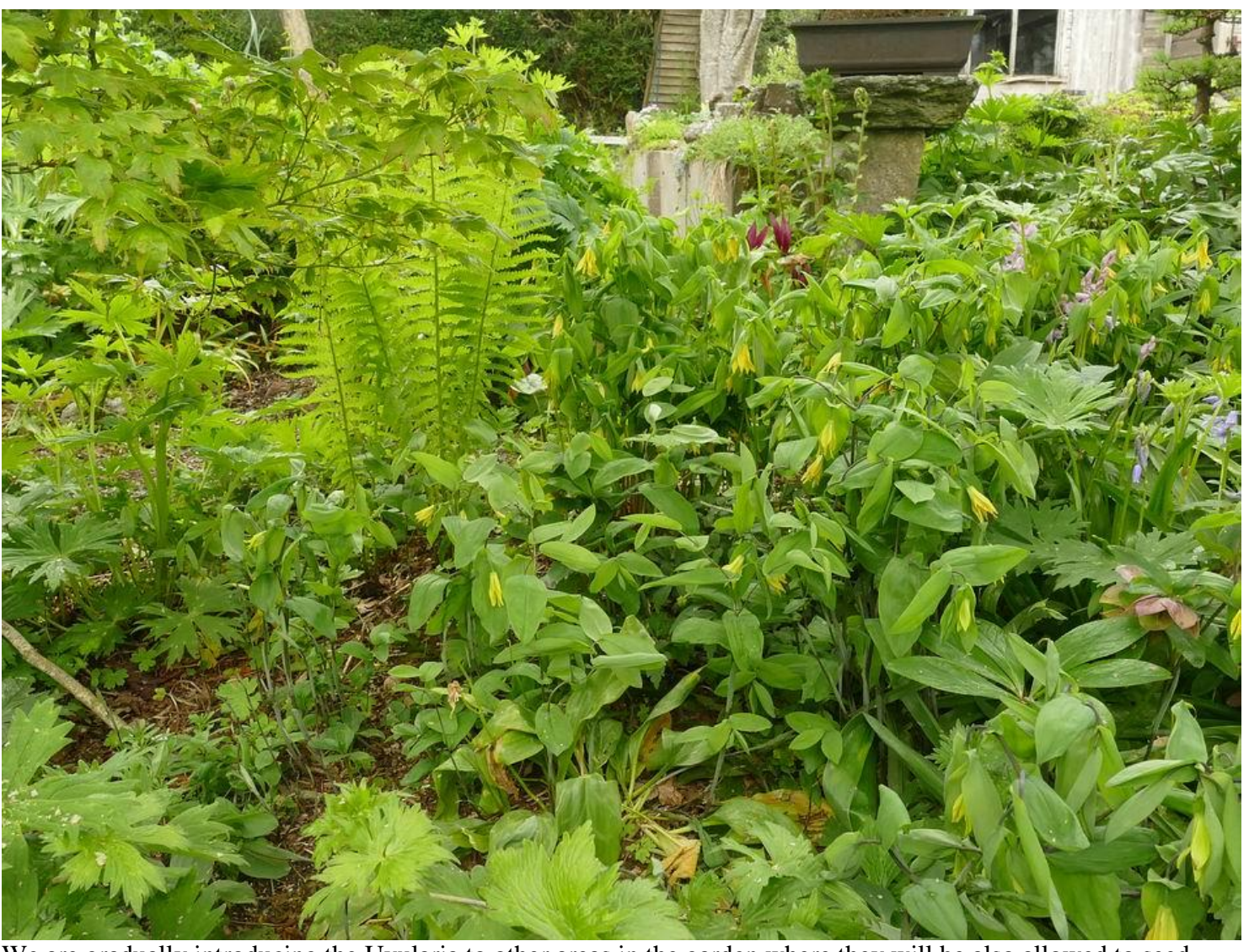
We are gradually introducing the Uvularia to other areas in the garden where they will be also allowed to seed.