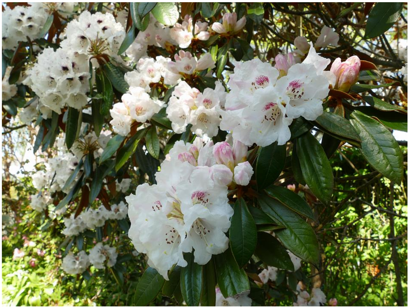
Rhododendron rex ssp fictolacteum, left and Rhododendron bureavii, right.