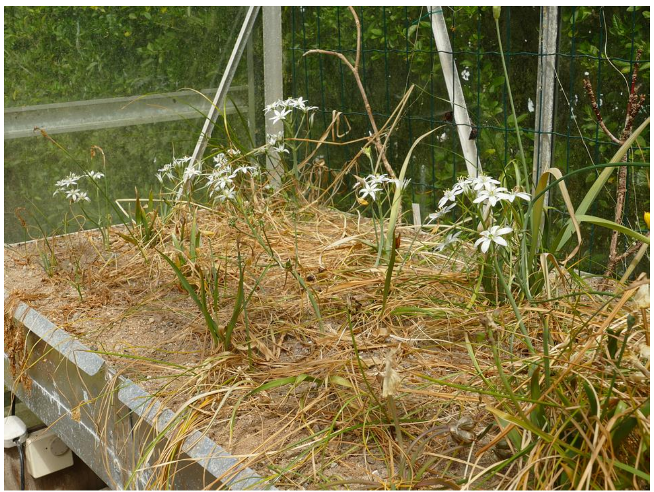
Another Ornithogalum sp. - this one which is from Turkey, grows slightly taller.

Most of the bulbs in the other bulb house sand bed are also in fast retreat now but there are still a few flowers and hopefully a few more to come in the summer as I seek bulbs to extend the flowering season for as long as possible.