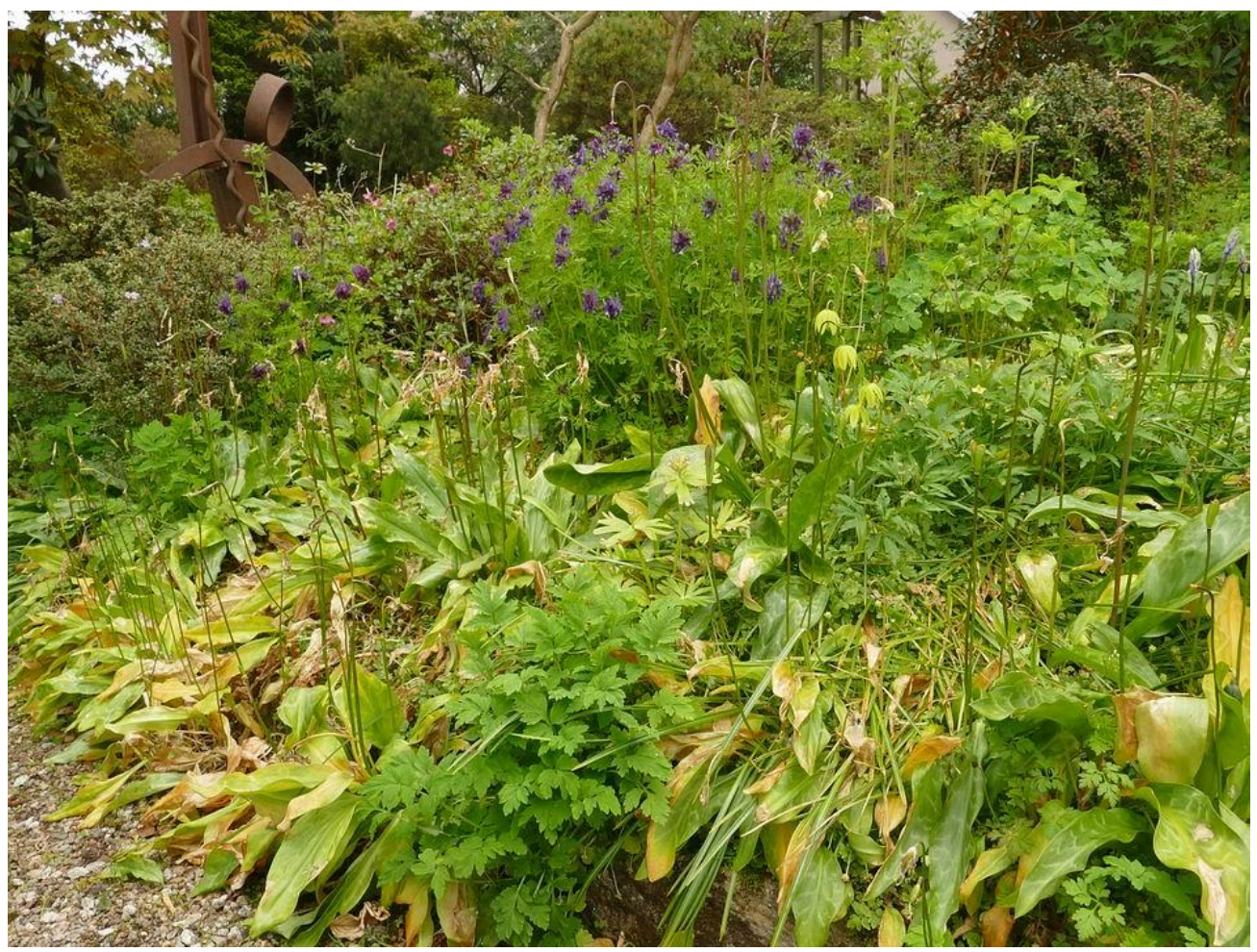
There is a similar situation in the garden where the cold/wet spring weather severely hindered successful fertilisation resulting in the bulbs going into retreat earlier than in more fertile years.