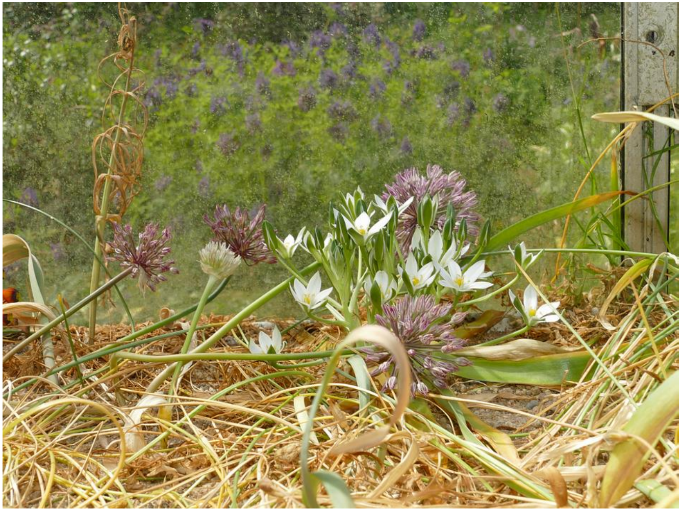
Allium and Ornithogalum flowers in the bulb house with Corydalis 'Craigton Purple' flowering beyond the glass.