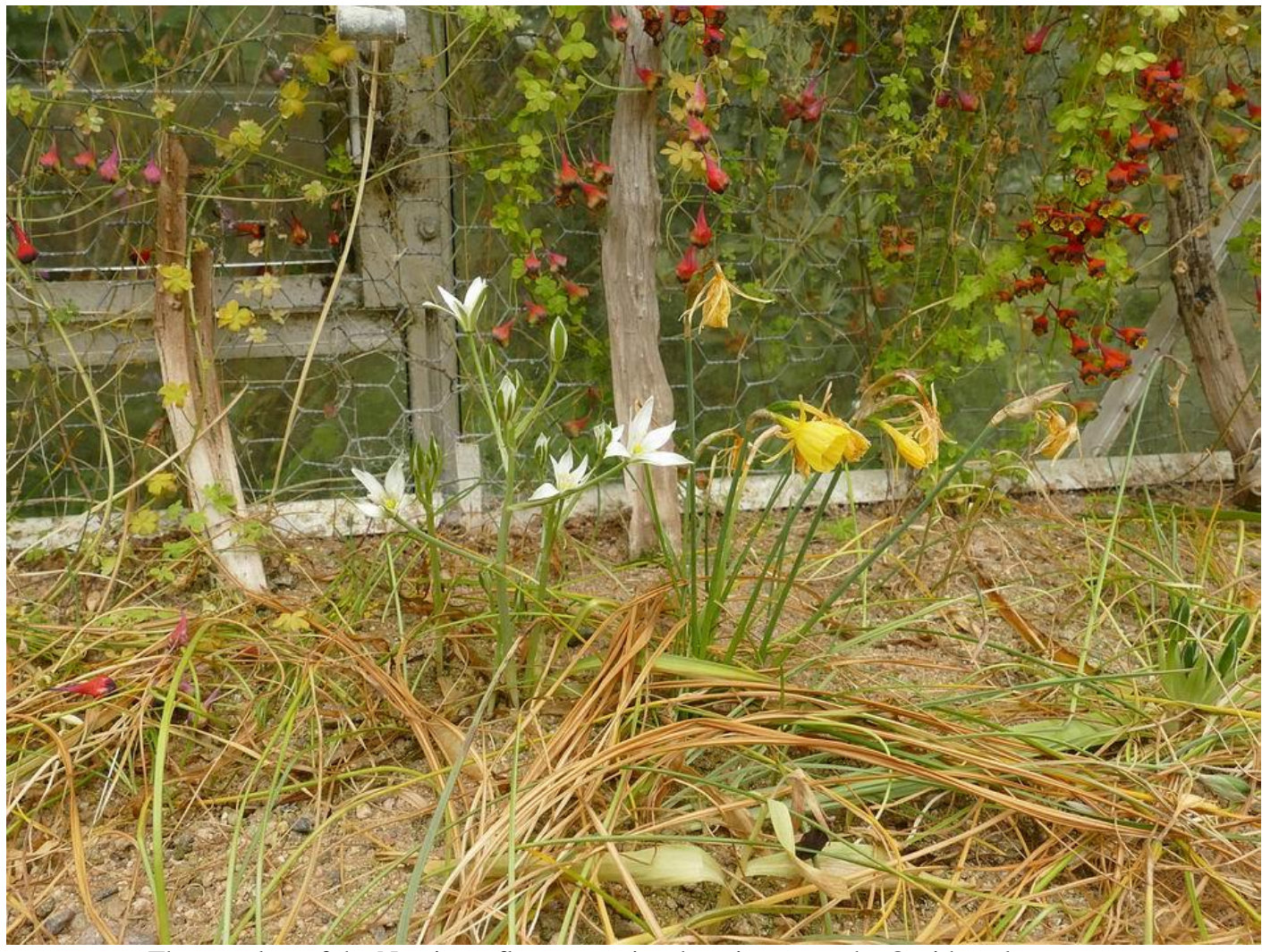
The very last of the Narcissus flowers are just hanging on as the Ornithogalum open.