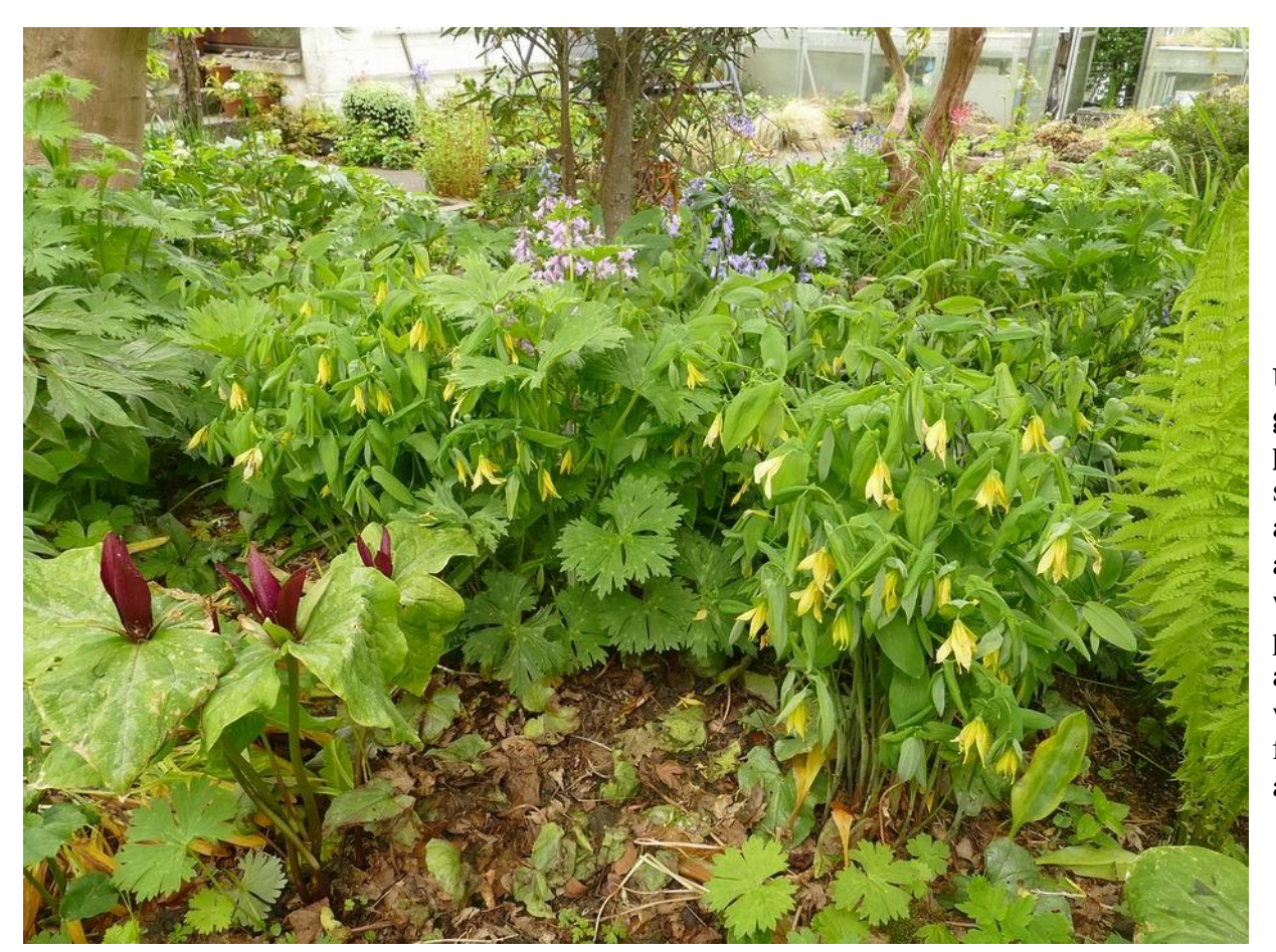
Uvularia grandiflora and perfoliata are both self-seeding around in a few areas of the garden where they provide interest and colour just when the earlier flowering bulbs are going over.