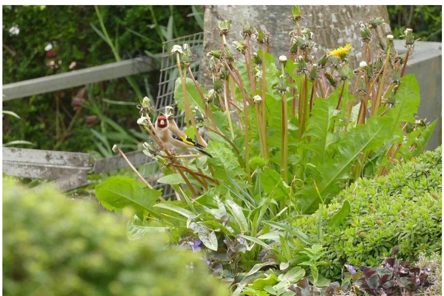
Goldfinch, Carduelis carduelis, feeding on Taraxacum officinale seeds.

This year we have had a big increase in the population of Goldfinches, flocks of which visit the garden feeders several times a day: then I noticed they were also eating the Dandelion seeds, stripping them as soon as the flowers shut so I have been allowing the birds to control the plant I only intervene if they have missed any.