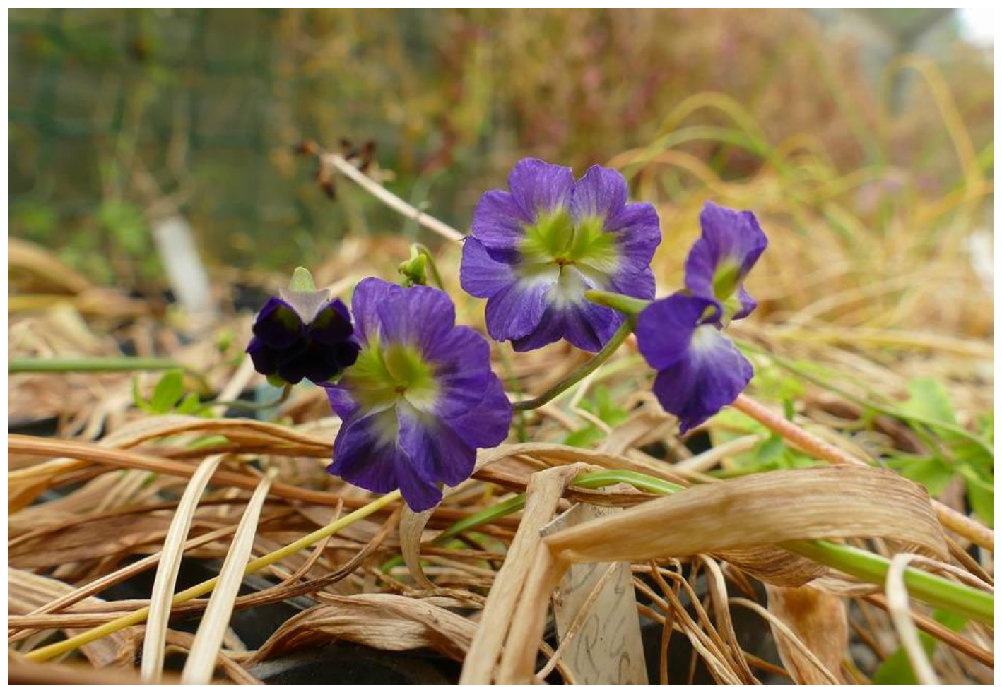
All our plants of Tropaeolum azureum were similarly affected but a few have managed to go on and flower as we expect. I am reasonably confident the tubers will survive.

Tropaeolum tricolor is not doing as well as it did in previous years because it is one of a number of plants that suffered in the very cold, -14C, conditions earlier in the year. I believe the roots may have been damaged by the deep frost which has prevented sufficient nutrients and water from reaching and supporting the growth.